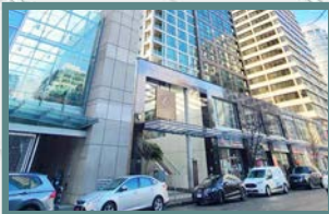
1132 ALBERNI STREET