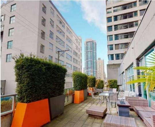
Private Outdoor Patio