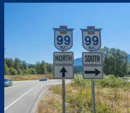
Sea to Sky Highway