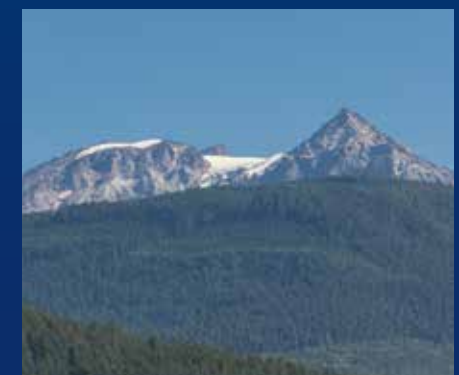
Mountain views in Squamish