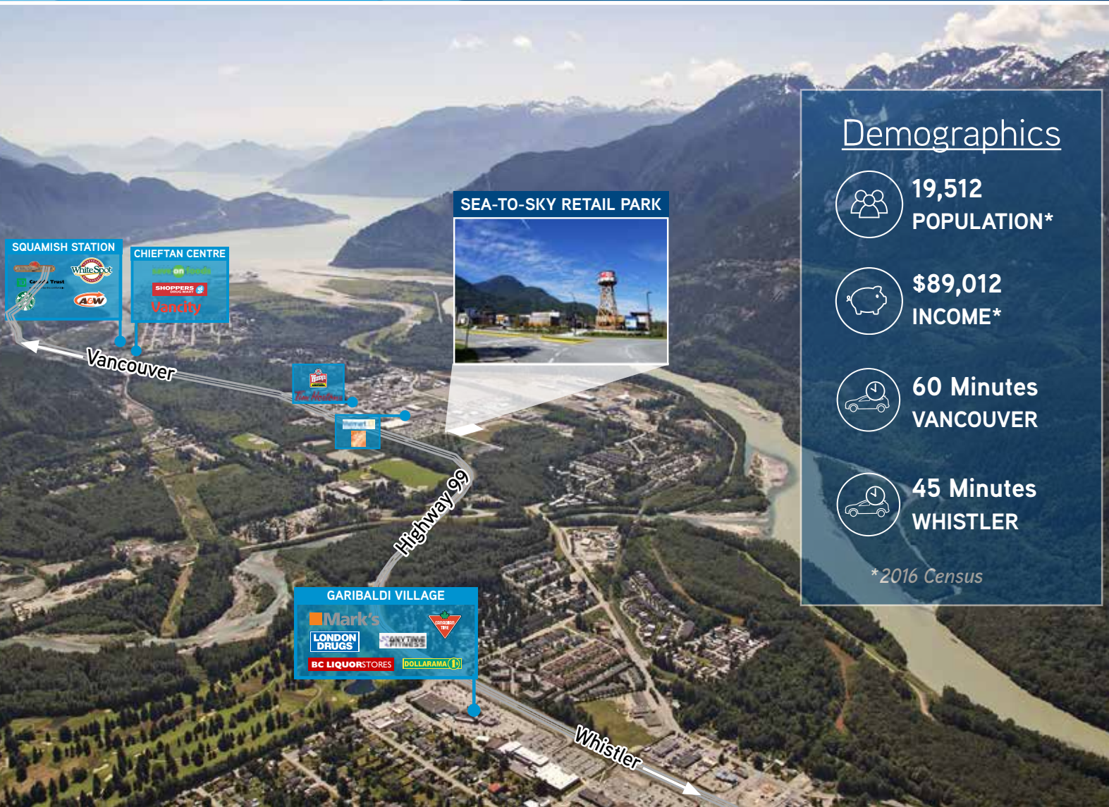
SEA-TO-SKY RETAIL PARK