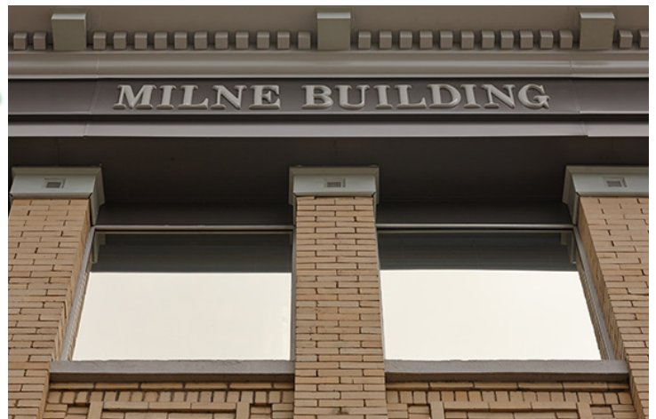
Historic Milne Building - Est. 1911